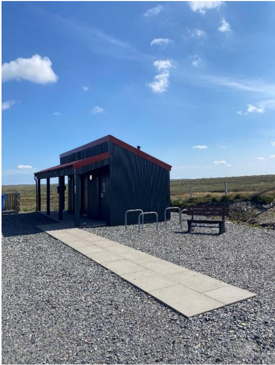
Path to facilities.