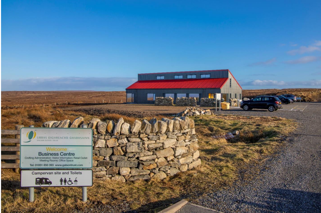
Business Centre from road view. The Campsite facilities are just behind the pictured building.